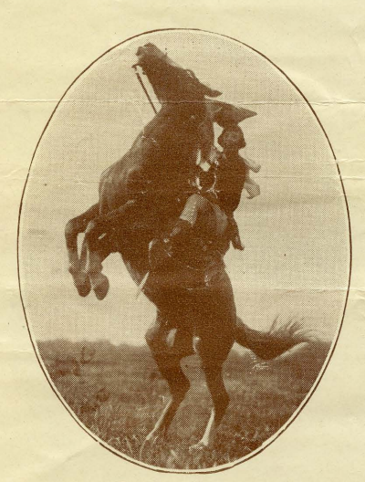
One of the best-known Cowgirls of the West.