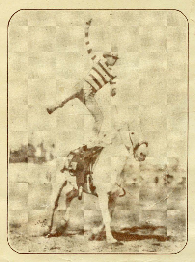
HANK POTTS One of Our Best.