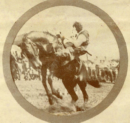
Tumble Weed Has thrown more Cowboys than any other bucking horse in the West.

Dedicated to that clean spirit of sportsmanship which glorifies the victor and does honor to the vanquished— The Spirit of the Baker Ranch Rodeo Stadium.