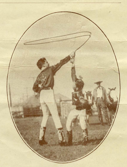
McFarland Boys Trick Ropers and Riders.