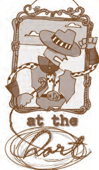
Illustration by Liz Burrill