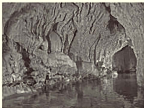
Natural Bridges cave today