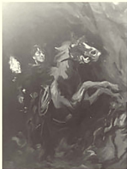
"I just dug into it and climbed like a wild hoss that I was."

We hope you will join us at Silents Under the Stars on Saturday, August 11, and that you will take a moment to visit the Mansion before dinner, to take a close up look at the painting representing this exciting action – we'll make sure to point it out!