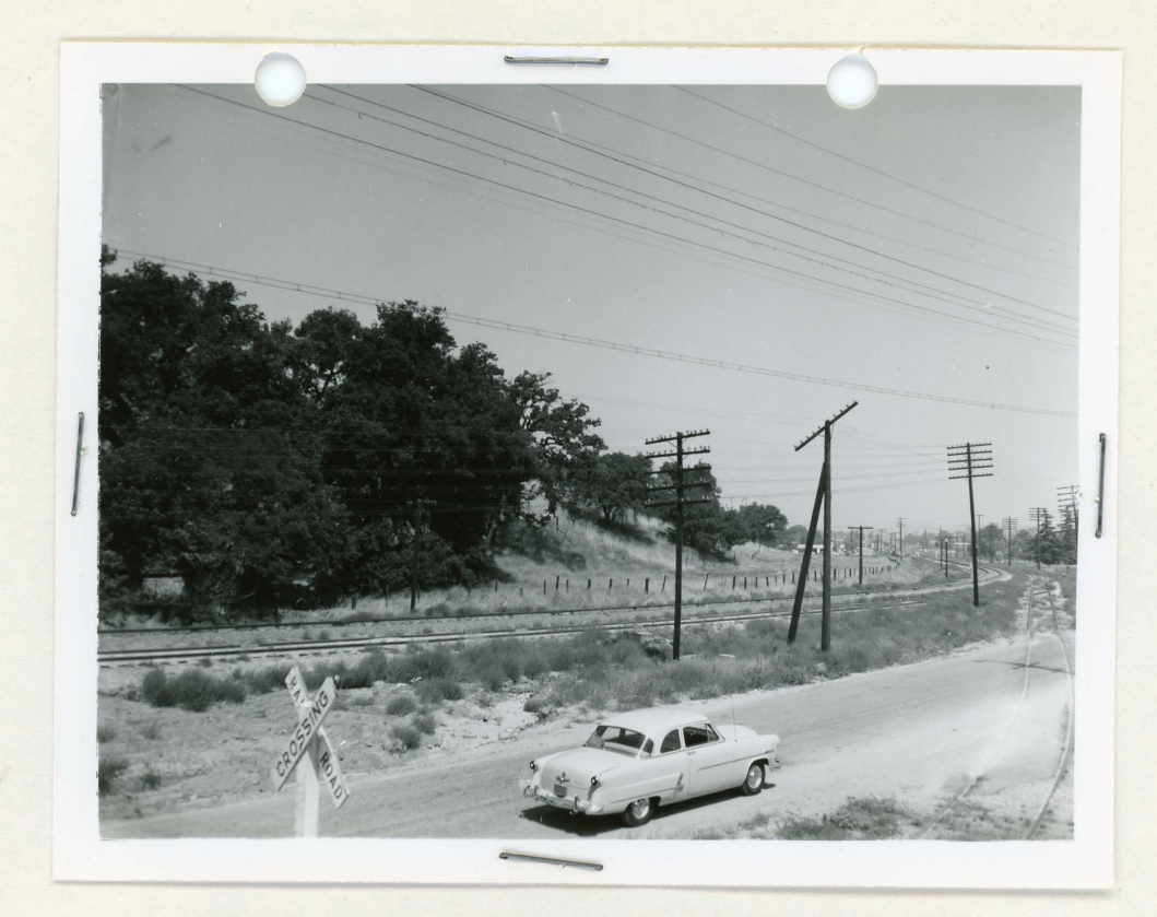
VIEW OF SOUTHEAST PORTION OF PROPERTY FROM ACROSS SOUTHERN PACIFIC RAILR@AD (*** )