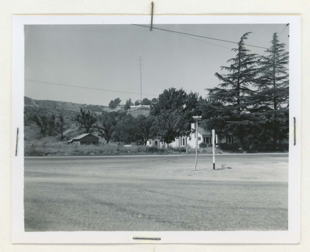
DWELLING AND BARN ON SUBJECT PROPERTY LOOKING SOUTHWESTERLY ACROSS SAN FERNANDO ROAD