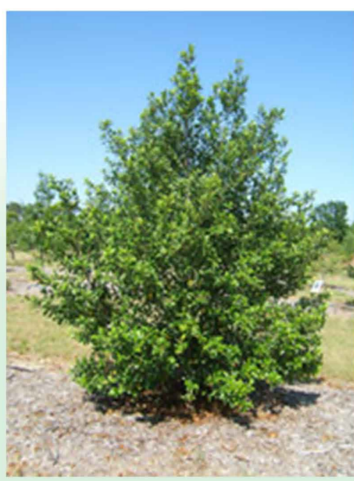
Prunus Caroliniana Hedge