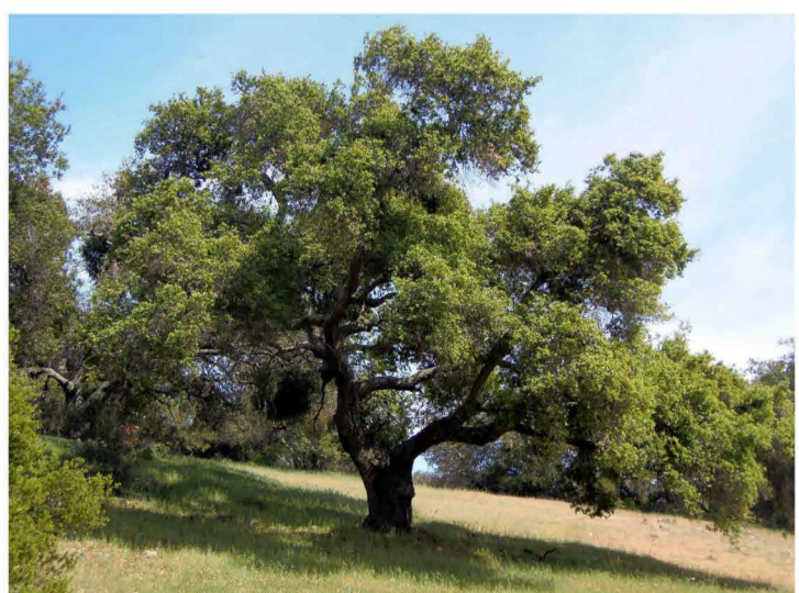
Coast Live Oak